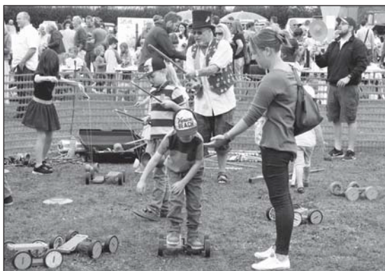
Children's entertainment at the August fête

Fundraisers was originally formed to raise money to build the current village hall. The committee now contributes to the upkeep of the hall, the church and to the High Bailiff's Trust on a regular basis and to other village organisations which apply for funding. The group runs the village fête in August and various one-off events. Suggestions