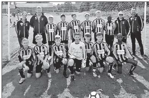
A junior football team with King's Head strip