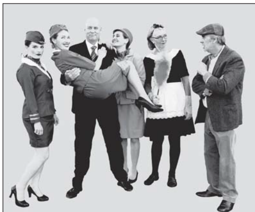
Players production of Boeing Boeing