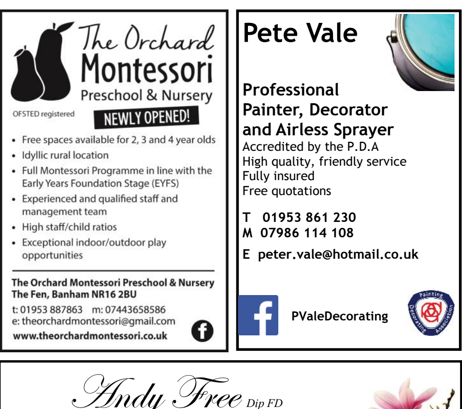
Independent Family Funeral Director

Fairfields, High Street, Attleborough, Norfolk. (Next to Attleborough Methodist Church)