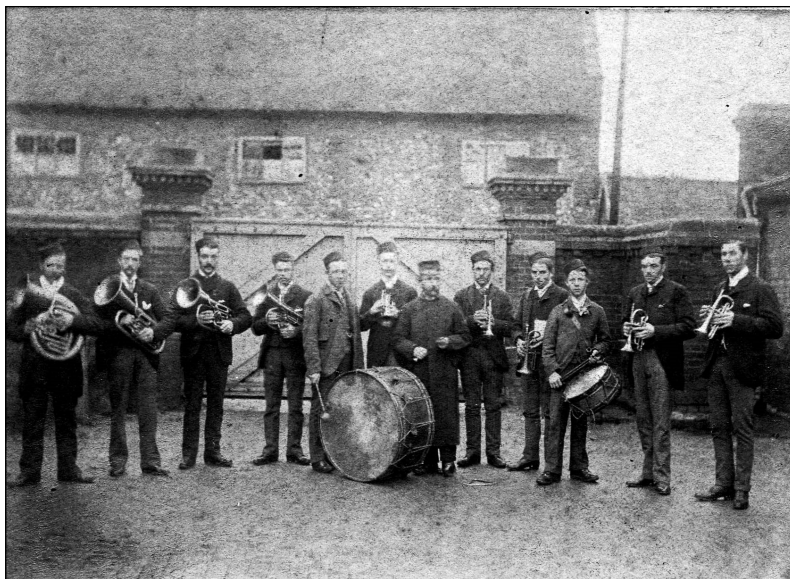
The oldest known picture of New Buckenham's Band, taken in the yard of The George Hotel, now Pump Court, probably around 1890.