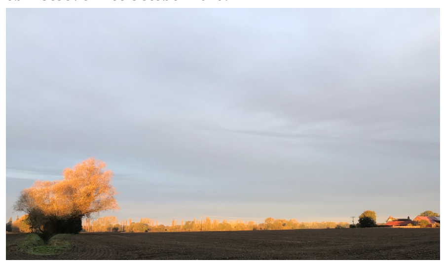
Trees reflecting the autumn sunrise, taken by Siobhan Frost during a recent visit.

Cover Photo: The end of the rainbow on Folly Lane, taken by Robin Steel on 1st October 2020.