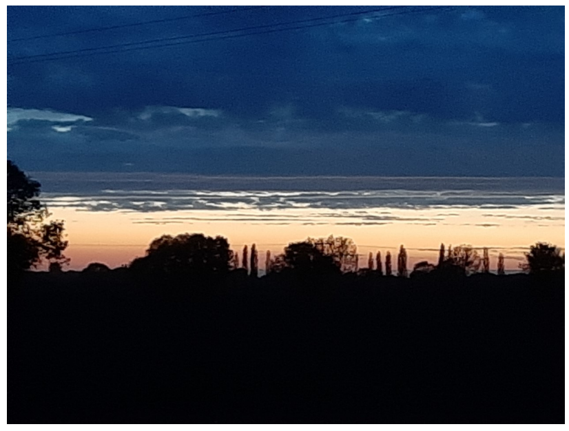
Sunset on 28th September 2020