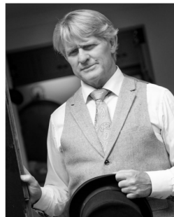
Brandon 2A Thetford Road | Brandon | IP27 0BS Telephone: 01842 811245 Email: brandon@turnerfunerals.co.uk