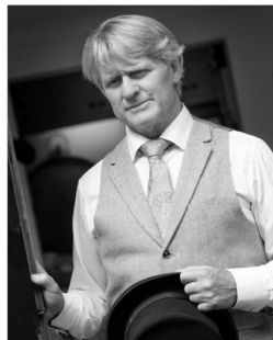
Brandon 2A Thetford Road | Brandon | IP27 0BS Telephone: 01842 811245 Email: brandon@turnerfunerals.co.uk